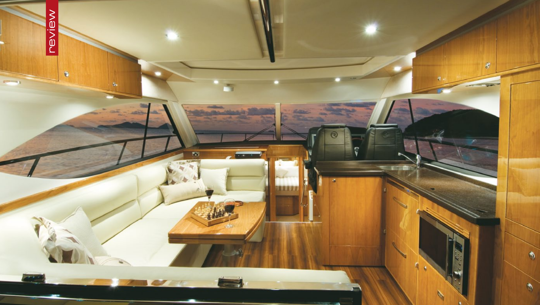
ABOVE: INTERIOR SPACE FEELS VERY LIGHT, AIRY AND SPACIOUS AND HAS A HUGE ELECTRIC SUNROOF THAT SLIDES OPEN.