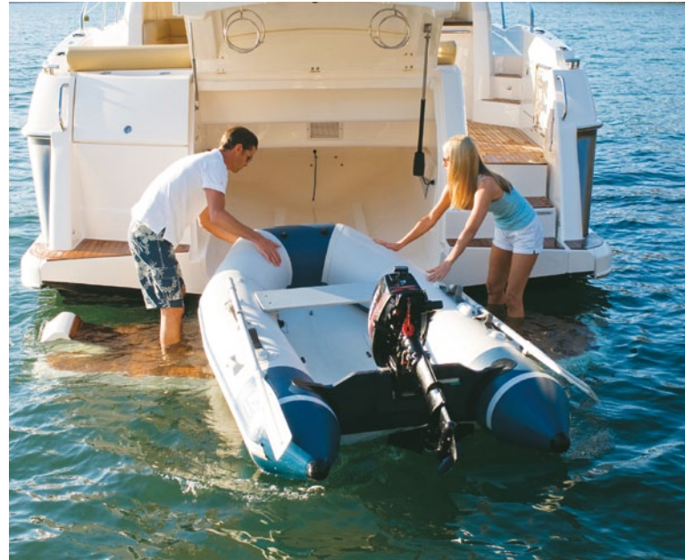
ABOVE RIGHT: THE TRANSOM FEATURES A LARGE GARAGE HOUSING A 3.1-METRE ZODIAC TENDER.

debris. Each unit includes twin forward-facing, counter-rotating propellers on each drive unit. Each drive unit is capable of turning independently to provide correct thrust to move the boat in the direction required by the driver, controlling the system either through a wheel or joystick at the helm. The Zeus drives can turn 15° in and 45° out. Steering is controlled by an electronic system that makes the helm one finger light and super fast; only two turns from lock to lock.