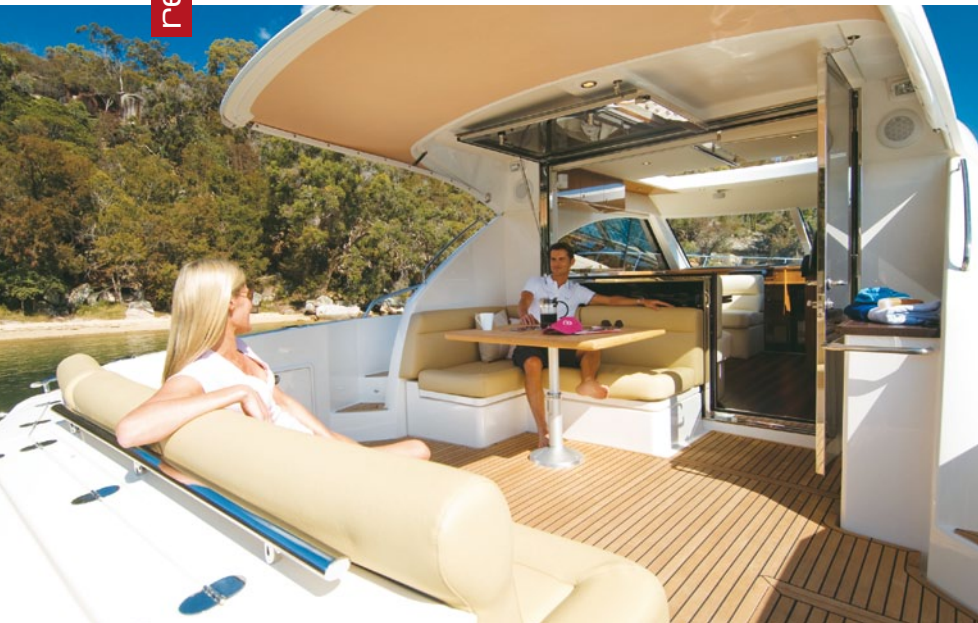
ABOVE: THE COCKPIT HAS A WIDE LOUNGE ACROSS THE TRANSOM AND TWO OPTIONAL LIFESTYLE CONFIGURATIONS.